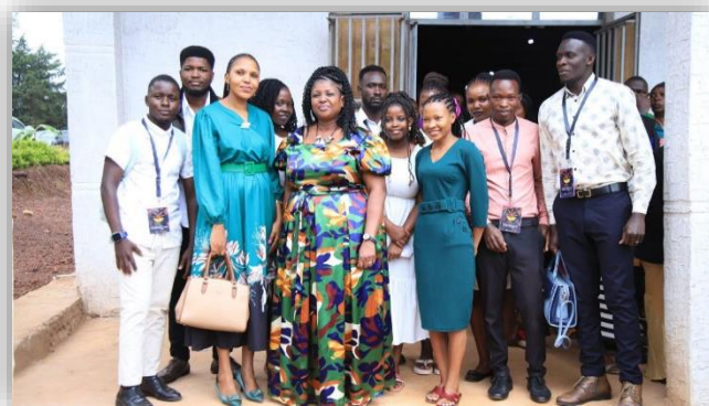
Figure 17: The Levites Care Team together with some of the Ministers of God at Believers Community Church (BCC)