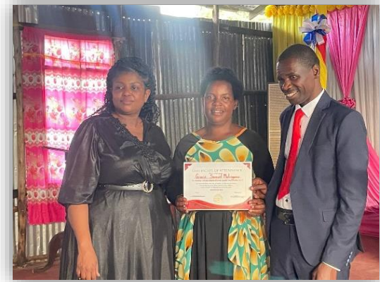
Figure 31: One of the graduates receiving her Certificate of Attendance