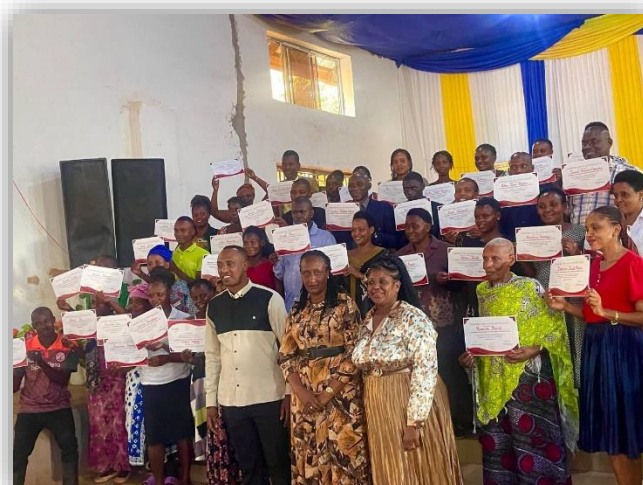
Figure 16: A group photo of the Graduates at Believers Community Church (BCC)