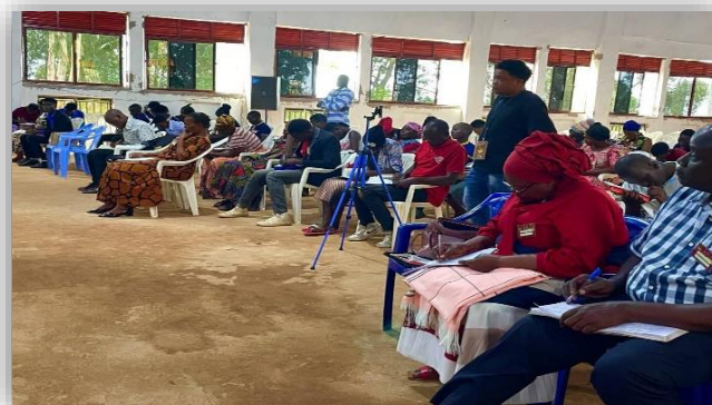
Figure 11: Participants in one of our training sessions noting down the content provided