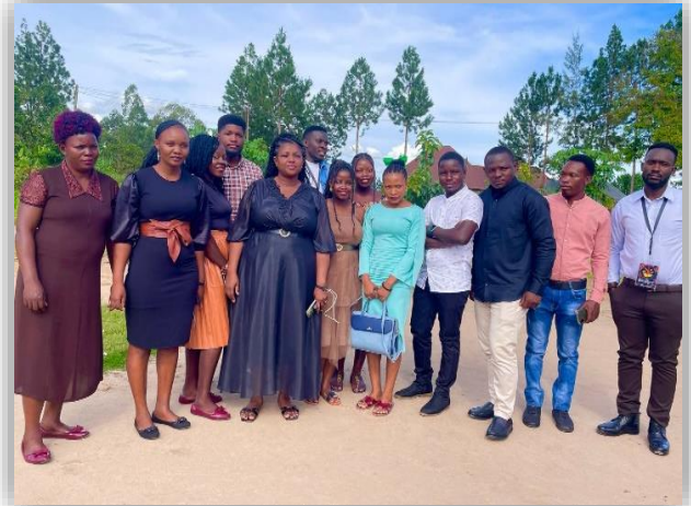
Figure 33: The Levites Care Team