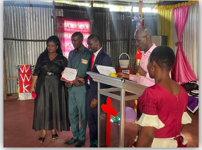
Figure 29: Handing out of Certificates to Graduates