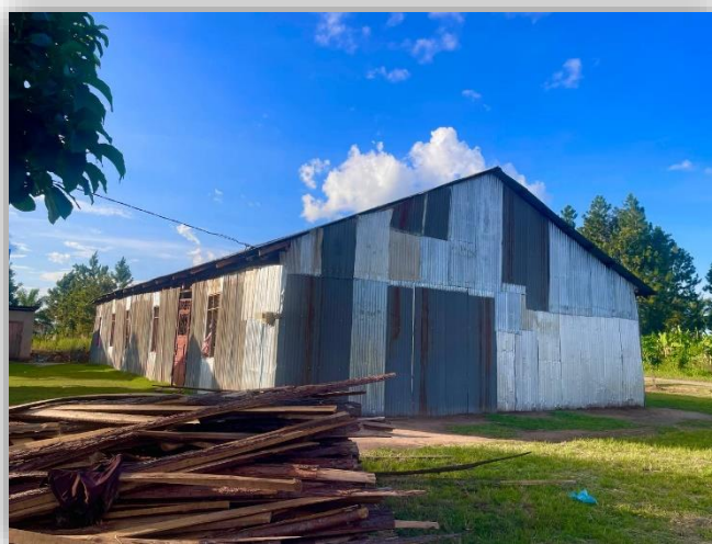
Figure 19: Tanzania Assemblies of God (TAG) Church premises in Bunazi, Tanzania