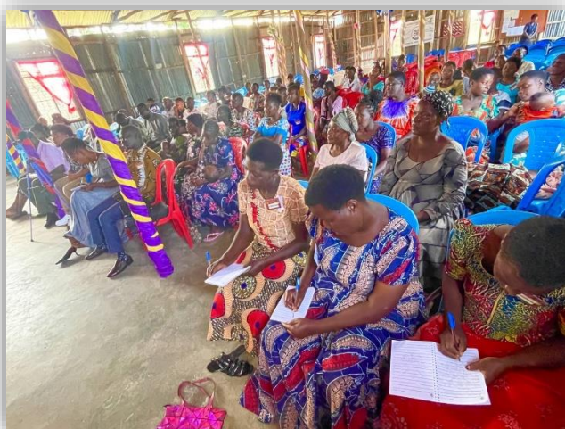
Figure 26: Participants attentive and taking notes during a training session