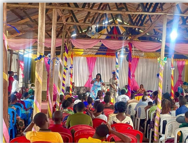
Figure 24: Pr. Joana training God's ministers at TAG