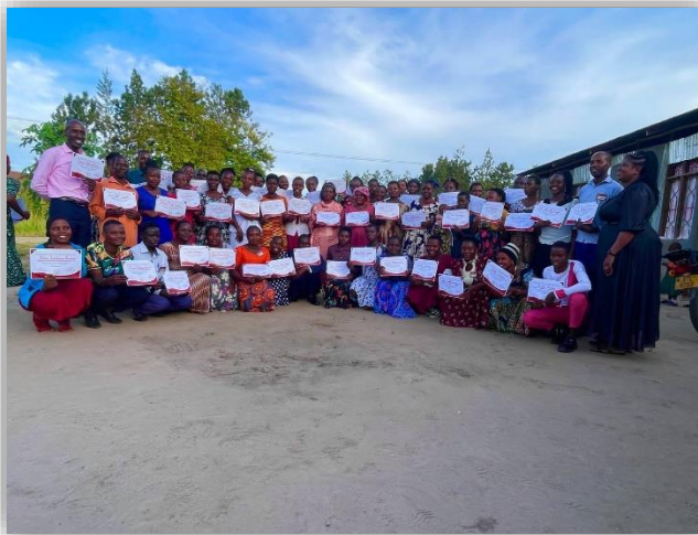
Figure 32: Photo showing all the 61 graduates at TAG