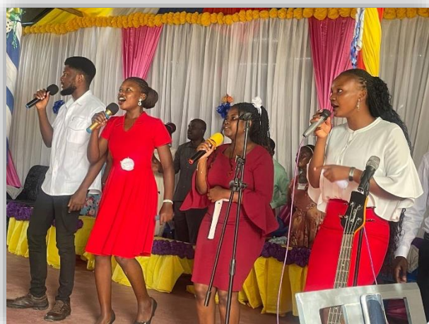
Figure 21: Stewards of Worship Choir leading a praise & worship session