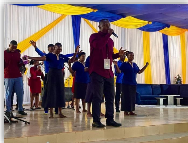
Figure 3: Stewards of Worship (SOW) choir leading the Worship session