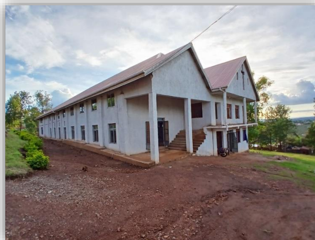
Figure 1: Believers Community Church (BCC) premises in Karagwe District of Tanzania