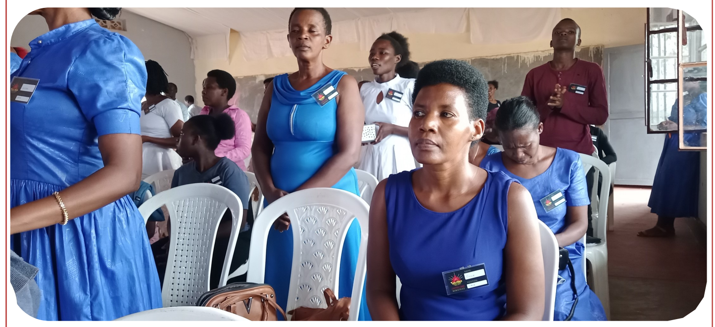
One of the CFPC Church individuals seated in one of our training session neatly wearing her name tag