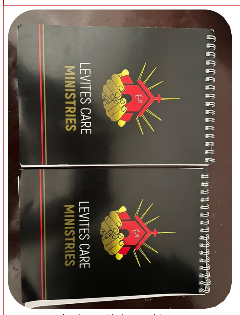
Note books provided to participants