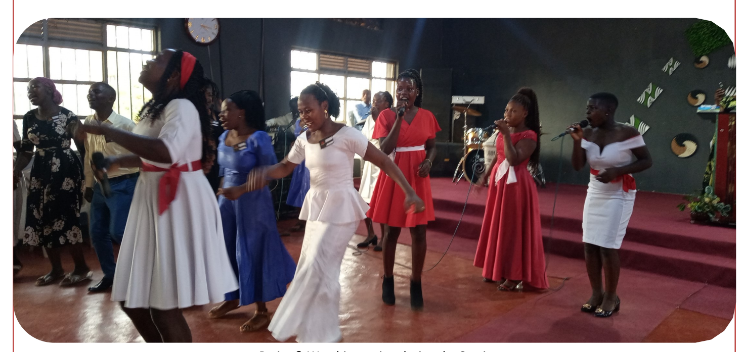
Praise & Worship session during the Seminar