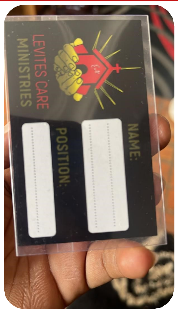
Name tags provided to participants