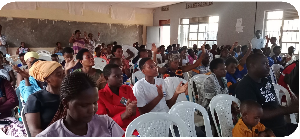
Church individuals at CFPC in one of our teaching sessions