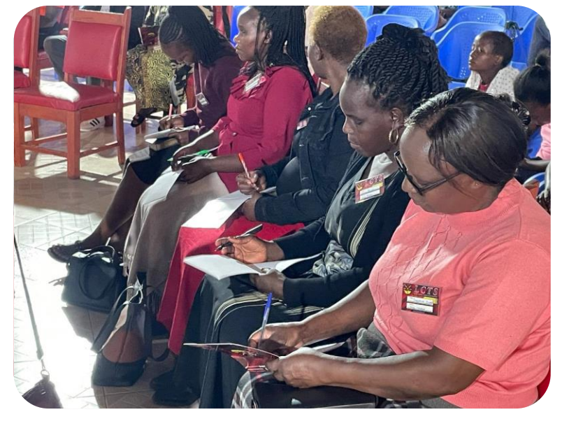
Figure 13: Participants seated with their notebooks writing down the contents of the program