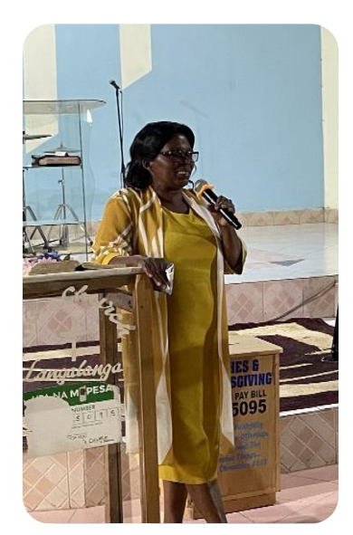
Figure 36: Interpreter of Day Four. She intrepreted all speakers of the day.