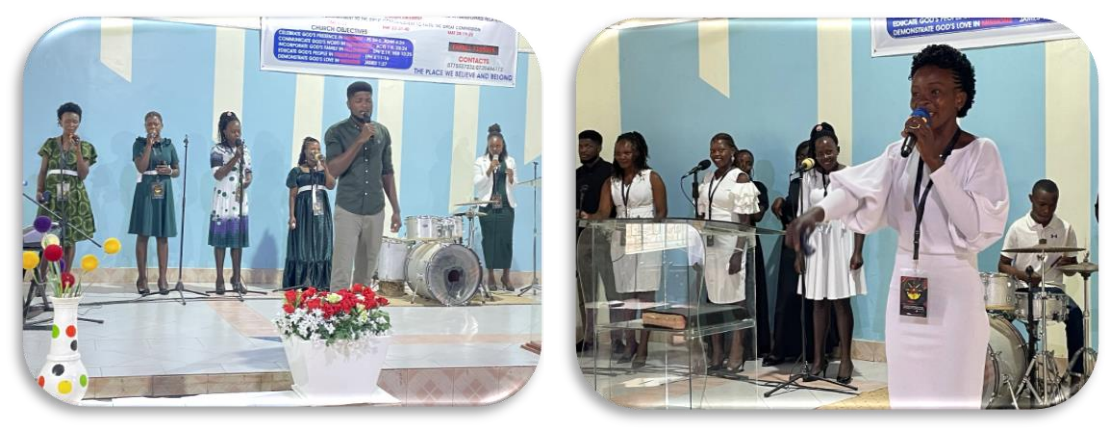
Figure 16: Stewards of Worship (SOW) leading a Worship session

• Worship Sessions: Each lesson began with a worship session led by the "Stewards of Worship" choir, setting a spiritual tone for the day.