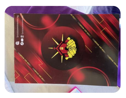
Figure 15: Notebooks handed to participants