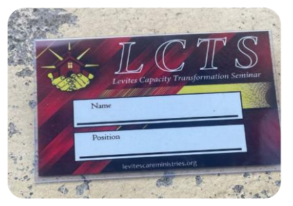
Figure 14: Nametags given to participants