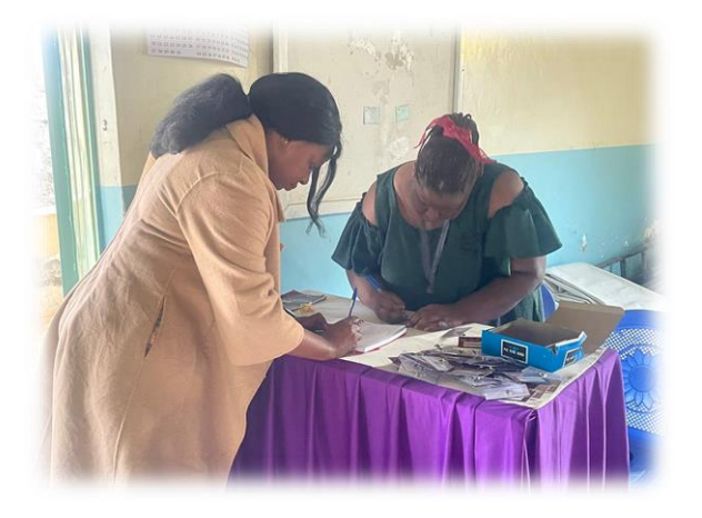
Figure 12: Participant registration at the Entrance