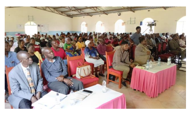
Figure 10: Church Leadership on the first row of the congregation