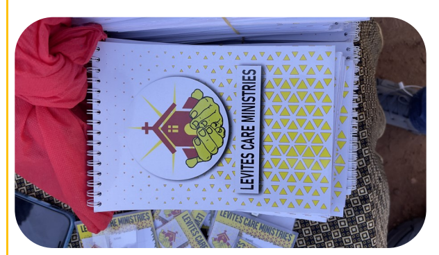
Notebooks provided to participants