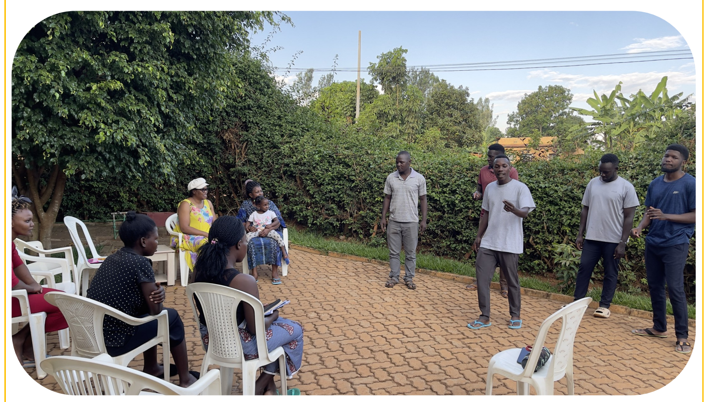
Levites Care team in praise and worship rehearsals