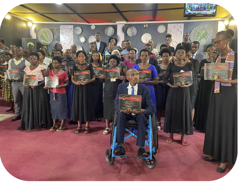
CFC graduates holding their Certificates of Completion