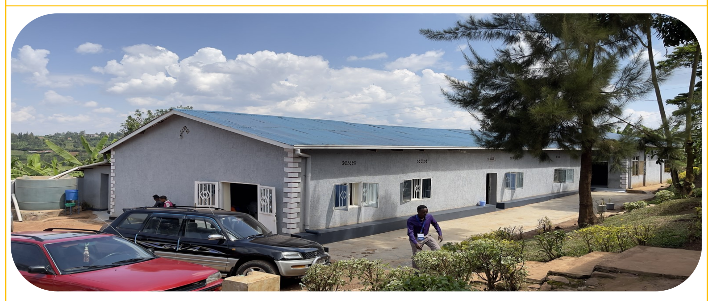
Christian Foundation Church (CFC) Premises in Kigali, Rwanda