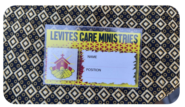
Name tags provided to participants