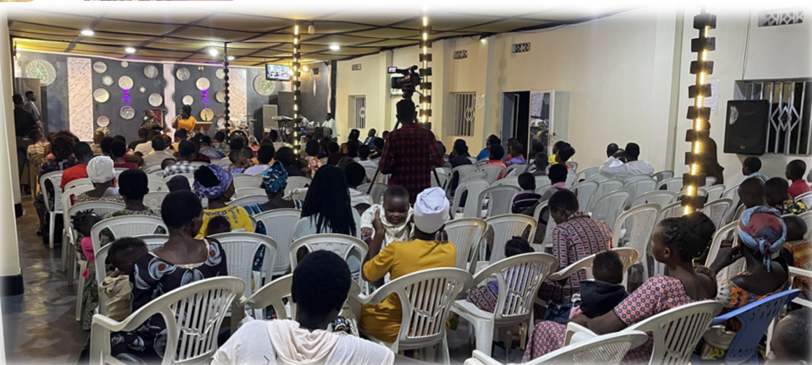
Church individuals at CFC in one of our teaching sessions