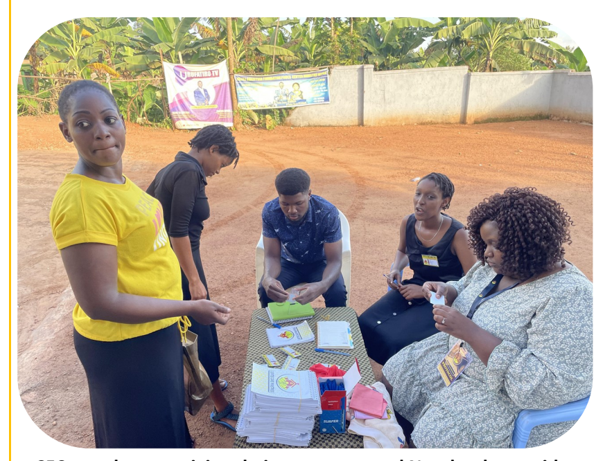
CFC members receiving their name tags and Notebooks outside church premises